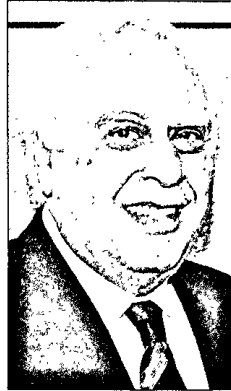
TOUGH TASK: Kapil Sibal

At the May 28 meeting, members of the IIT Council, which comprises directors and chairperson of the board of each of the IITs, had rejected the idea of implementing the new system from 2014. However, what remains to be seen is how the council will respond to the idea of postponing the implementation of the new system in light of the developments and protests since May 28. Speaking to ET, IIT Bombay chairperson Anil Kakodkar said: "If you